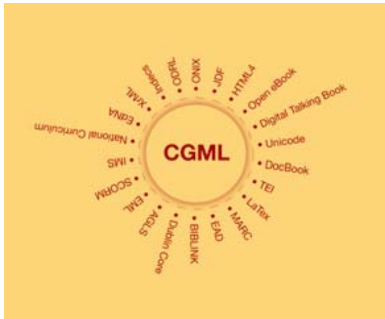
Figure 3. The interlanguage approach – full interoperability between 17 schemas requires a thesaurus with just 17 sets of tag synonyms.

An interlanguage has no life of its own, no independent existence, no relation to reality other than a mediated relationship through other languages. We will outline the operational principles for the construction of such an interlanguage through the subsequent subsections of this article.