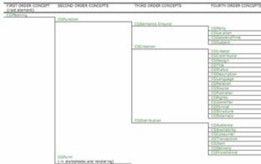
Figure 4. CGML Taxonomy of Authorship and Publishing: first to fourth level concepts. The remaining of the approximately thousand tags add detail at the fifth level and beyond.

<LocalTextStructures> down to the level of <Paragraph> or <Emphasis> for words or phrases). These are supplemented by <Externals> which refer to the <Work> in question, such as a <Review> or <RefereeReport>. The final third-level concept <Distribution> provides a framework for the tagging of <Audience> (who a <Work> is meant for), Availability (where and how it can be found), <Consumer> (who reads or uses it), <Item> (an individual manifestation of a <Product>), <Transaction> (the legal basis of a particular <Consumer> use), <Delivery> (how the <Item> reaches the <Consumer>) and <Provenance> (where the <Item> has been during its life). This is the beginning of a paradigm which currently runs to a thousand <Function>s within the field of <Meaning>, and whose main focus at this stage is the creative process of authorship and the publication of books.