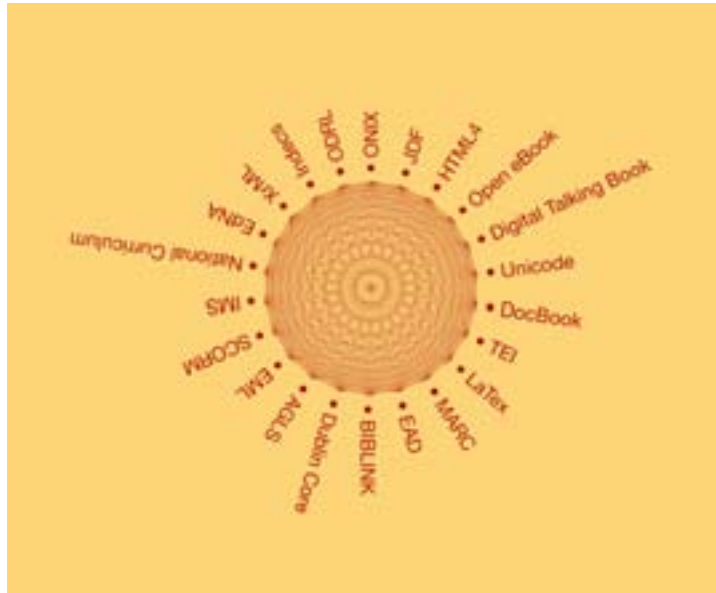
Figure 2. Language pairs – full interoperability of 17 schemas requires 272 crosswalks.

Paskin suggests that this level of complexity can be eased by mapping ‘through a central point or dictionary’ (Paskin, 2003). This is precisely the objective of CGML. CGML is an intermediating language, or an interlanguage through which a full set of translations can be achieved. Tag by tag, it represents a common ground between tagging schemas. Tag <x> in the tagging schema A translates into tag <q> in CGML, and this in turn may be represented by <y> in tagging schema B and <z> in tagging schema C. The ‘common-ground’ tag <q> tells us that <x>, <y> and <z> are synonyms. A theoretical 272 crosswalks are replaced by 17 thesauri of tag synonyms. If, by analogy, all European languages were to be translated through Esperanto, a language deliberately fabricated as a common-ground language, 60 dictionaries would be needed to perform all possible translation functions instead of a theoretical 3540. Even simpler, in theory just one dictionary would suffice, translated 60 times with 60 language-to-Esperanto thesauri. This is precisely what CGML does. It attempts to solve the semantic aspect of the interoperability problem by creating one dictionary and 17 thesauri of tag synonyms. (And, incidentally, returning to natural language for a moment, this technique can be used as a semantic basis for machine translation, bringing the inter-translatability of all human languages at least into the realm of possibility.)