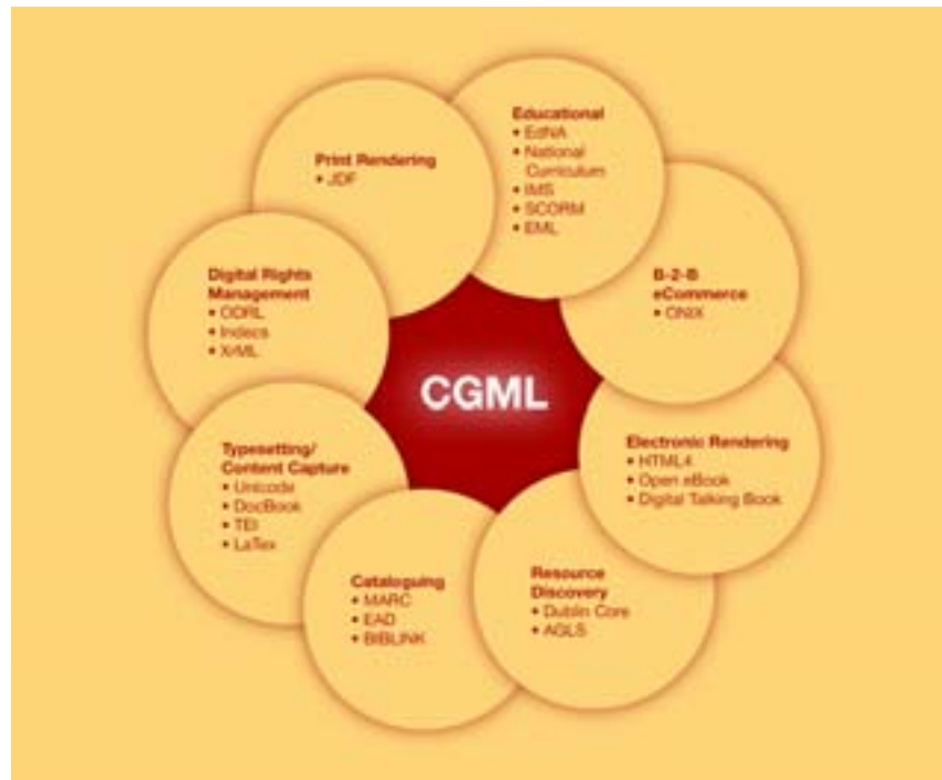
Figure 1. CGML as an interlanguage.

is designed for use in web browsers, DocBook for the production of printed books, Open eBook for rendering to handheld reading devices and Digital Talking Book for voice synthesis. Very limited interoperability is available between these different schemas for the structure of textual data, and only then if it has been designed into the schema and its associated presentational stylesheets. Furthermore, it is not practically possible to harvest accurate metadata from data, as data structuring schemas and schemas for metadata are mutually exclusive.